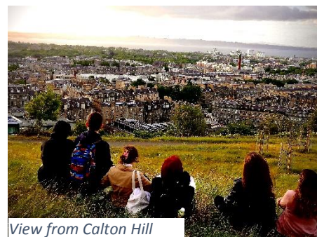
View from Calton Hill

Lastly, we hiked up to Calton Hill, which allowed us to look at the busy city from above and the surrounding green hills stretching all the way out to water of the Firth of Forth, which expands out to the North Sea. At the warm glow of the setting sun, we marvelled at the National