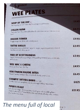
The menu full of local dishes and slang

Just as we were about to head back to our accommodation, we stumbled upon a street concert held by Scottish band, the Spinning Blowfish. We joined the crowd to listen to the sound of bagpipes mixed with modern music and decided to stay for most of the performance. It was an eventful