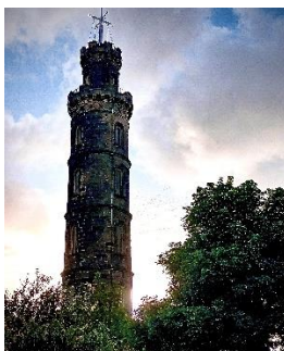
The Nelson Monument

Lastly, we hiked up to Calton Hill, which allowed us to look at the busy city from above and the surrounding green hills stretching all the way out to water of the Firth of Forth, which expands out to the North Sea. At the warm glow of the setting sun, we marvelled at the National