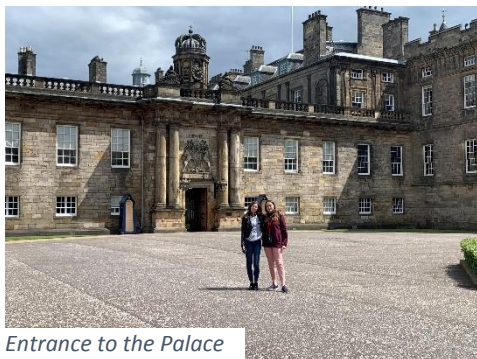
Entrance to the Palace

The third day of our trip was the busiest, with lots of sightseeing and walking around the streets of Edinburgh. With the help of the hop-on hop-off sightseeing bus, we learned about iconic locations such as Princes Street, the Royal Mile and Greenside. My favourite part of the day was the tour of Holyrood Palace, full of historical rooms but still used by the royal family to host special events.