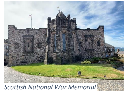
Scottish National War Memorial

On the last day of our trip, we had only one sight left to visit, which was none other than the Edinburgh Castle. We have seen glimpses of it looming over the city as we walked on Princes Street, but now it was time to hike up and head inside. The stronghold, which stands on Castle Rock, has a history about 1100 years old! The first settlement here can be traced back all the way to the Iron Age and a castle for royal residency was used from the 12 th century. In the 17 th century the role of the castle changed, and it became a military station housing a large garrison. Nowadays it is an important part of Scottish heritage and is open to visitors.